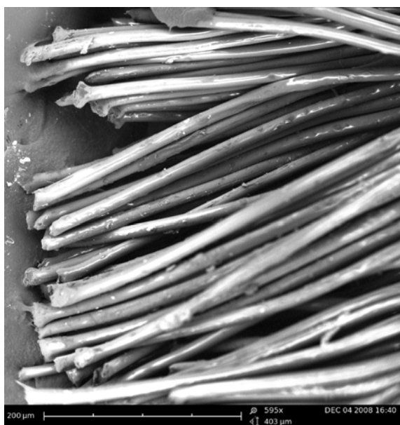
Fig. 2. Multifilament suture coated with triclosan

Ryc. 1. Widmo podczerwone FTIR-ATR z zaznaczonym pikiem triklosanu (1474 i 1490 \text{cm}^{-1} ); nić chirurgiczna T2